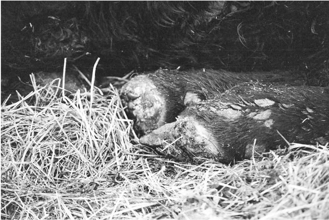
Figure 1. A cow that has sloughed her rear hooves after consuming endophyte infected tall fescue straw during a period of cold weather in Eastern Oregon.